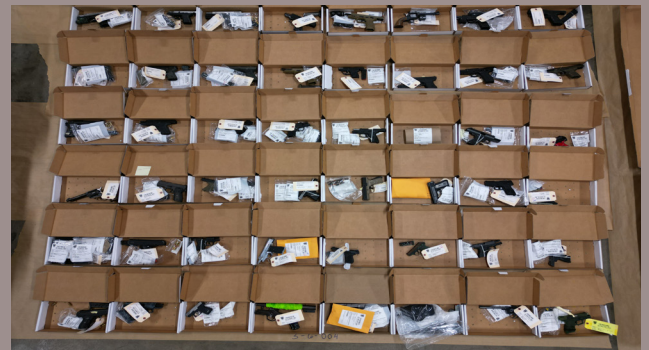
226 total guns seized in 2022